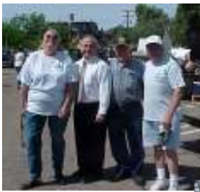
Inaugural VIP (Vandergrift Improvement Group) Community Cleanup June, 2004