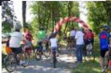
Coal & Coke Trail from planning the cleanup in 2004 to the dedication at Willows Park, Mt. Pleasant in 2007.