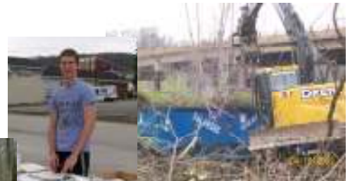
DARcee/Derry Borough cleanup April 2009