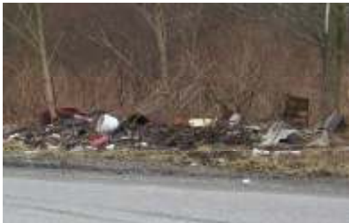
Just some of the trash to be cleaned up along the Little Crabtree Creek Trail in Luxor on April 10.

By the Way is published four times a year by Westmoreland Cleanways. Copies may also be found on our web site: www.westmorelandcleanways.org